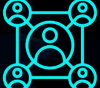
Branded Networking Session