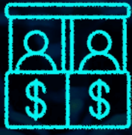
Interactive Expo Booth