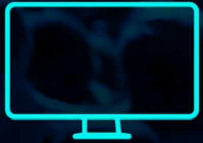
Dedicated Brand Session

Let's discuss your targeted goals in relation to the event in order to customize a partnership that directly correlates and delivers a strong ROI.