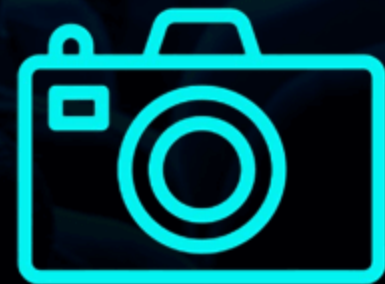
Branded Photo Booth