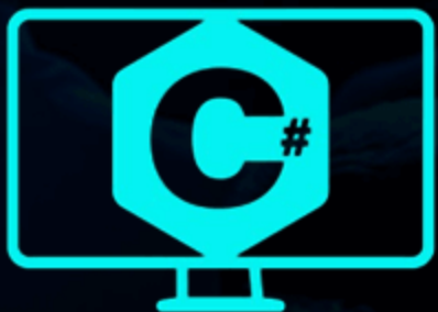
C# Corner Website Feature