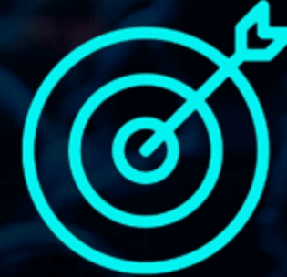
On-Screen Logo Branding