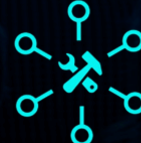
Event Service Provider