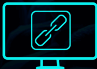
Event Website Presence